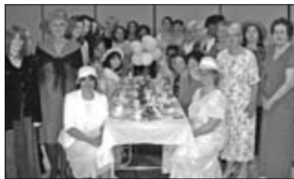
Ladies of the Charlotte, North Carolina, congregation gather for a group photo at the tea