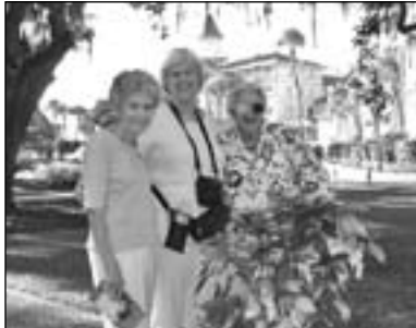
Jekyll Island, Georgia

Other activities during the Feast included youth instruction classes, teen and young adult hospitality rooms and the delightful children's choir. Brethren donated items and cash to shelters for battered women and homeless children. Golfers enjoyed a four-person scramble