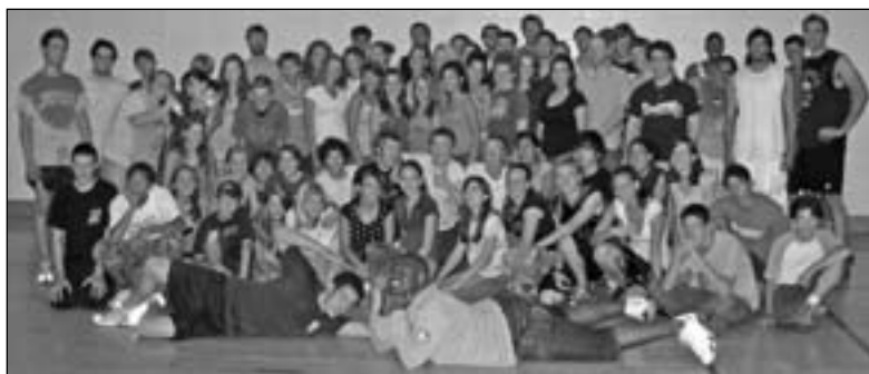
Teens and young adults at open gym night in California