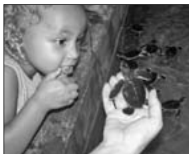
Sri Lanka

The weather was perfect for enjoying the pool and beach, featuring warm,