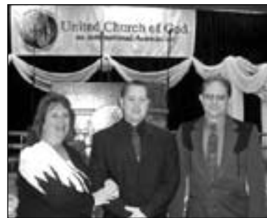
Bend, Oregon

Over 1,000 Feastgoers enjoyed one of the best Feasts ever at the Bend-Redmond