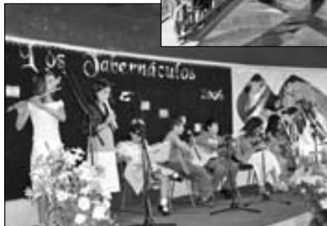
Mendoza, Argentina

space for activities and fellowship. Meals were served in a large dining room, and everyone ate together in a warm, family atmosphere. The soccer field was used by nearly everyone, with the feature game being the annual match between the men of the Church and the hotel staff. The warm spring weather also allowed for plenty of use of the pool, something the children especially enjoyed.