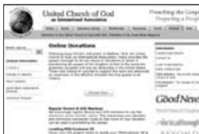
Online donations page at www.ucg.org/donation

A second reason is that it would be quite costly to United if the membership (which contributes close to 90 percent of the Church’s total income) switched from sending paper checks to using credit cards. For this service we would be charged credit card fees,