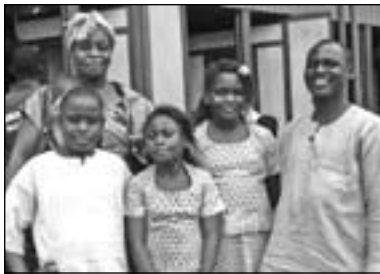
Ghana

After the First Holy Day everyone went to the housing quarters only to find that the original owner had taken the rental money from the Church and then promptly sold the building. Written contracts often do not carry much weight in this part of the world, so as often is the case, the arrangement was sealed with a