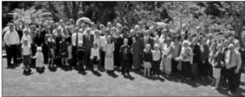
Group shot of Feastgoers in Taupo, New Zealand