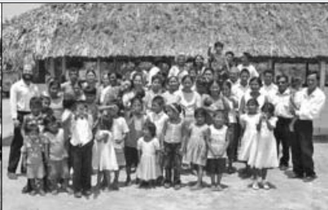
Touring Ephesus in Turkey; Feastgoers in northern Brazil