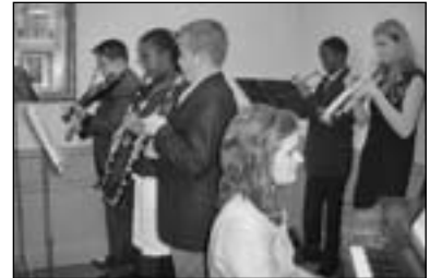
Collingwood, Ontario

felt the warmth and friendliness when he arrived on Friday evening and it carried through for the whole Feast. Many brethren