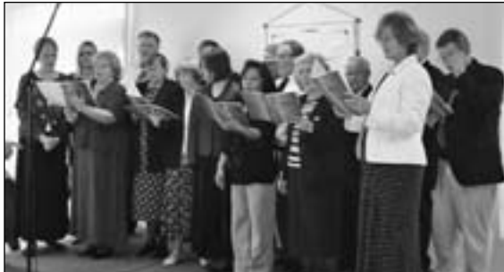
St. John's, Newfoundland, Choir

held in St. John's again this year. We had a maximum attendance of 72, and the smaller number of people again made for a more family-style Feast. It was God's Feast, and it showed in the cooperation and outgoing concern of attendees.