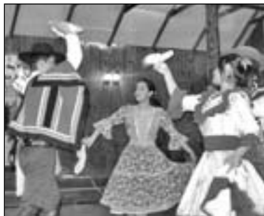
Chile

Teamwork was evident in every activity. Many brethren agreed on the fact that this was a most inspiring Feast. The rain of the south of Chile made the environment an ideal place for meditation and prayer. It was also an ideal environment