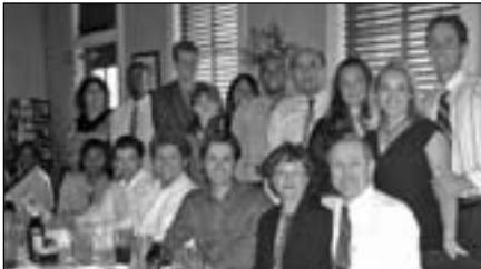
Miami and West Palm Beach, Florida, young adults fellowship after Young Adults' Day

For the first time ever, Miami and West Palm Beach, Florida, young adults combined to serve at the Miami