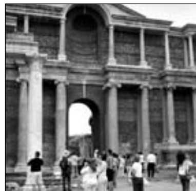
Feastgoers tour Sardis

This year 123 people celebrated the Feast of Tabernacles in the "other holy land," i.e., modern-day Turkey where the seven churches mentioned in Revelation 2 and 3 can be found. Three full touring buses accommodated our travels to visit sites where familiar biblical characters like the apostle Paul, the apostle John and Timothy once walked.