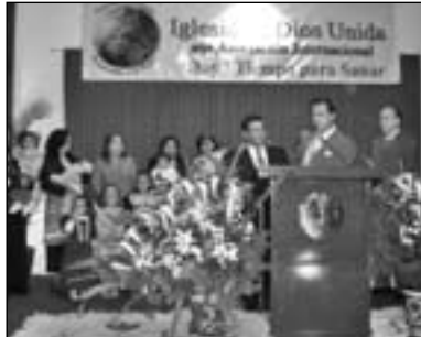
Blessing of the children, Mexico

We had visitors from the United States and a family from the Dominican Republic. The Feast was held once again in the