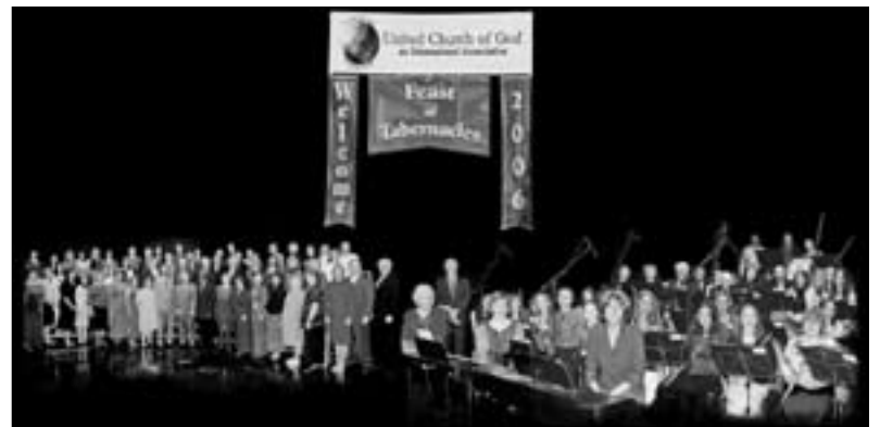
Wisconsin Dells choir and orchestra

Three words summarize the Feast at Wisconsin Dells in 2006—unity, inspiration and joy. The theme of many messages focused on keeping the vision of God's Kingdom alive. Many brethren commented on how meaty the messages