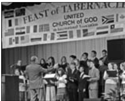
Lancaster, Pennsylvania

The highest attendance came on the first day of the Feast when over 1,350 people were in attendance. The messages given by the ministry were inspiring and continually pointed toward the fulfillment of God's plan for man. In addition