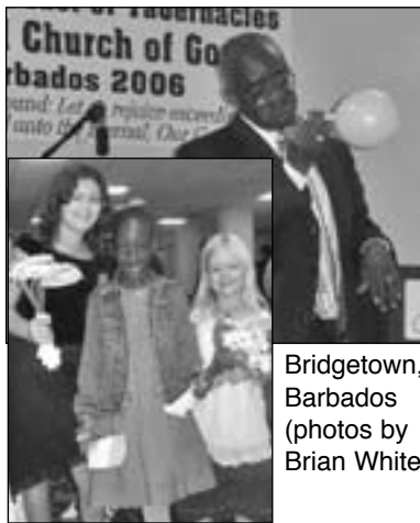
Bridgetown, Barbados