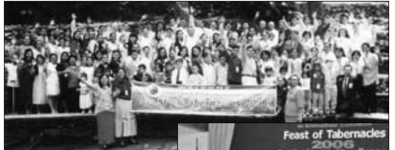
Baguio City, Philippines

folk dances from different countries around the world and a variety of songs presented by the brethren. Several pieces of native Filipino music were likewise performed by brethren playing native stringed instruments similar to the mandolin called bandurias and octavinas , accompanied by a guitar.